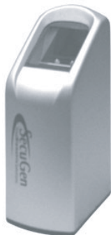
Desktop biometric control for the office environment.