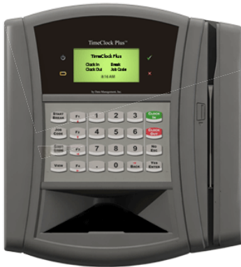
RDT 200 Series Access Terminal

TimeClock Plus enables management to collect and report data in real-time, up-to-the-second, at any time of day, rather than by using antiquated pollable or punch devices located throughout a place of business. Using existing PC's or network workstations, TimeClock Plus allows businesses to monitor, control and report all aspects of employee time and attendance while reducing the cost of overtime, administrative labor and clerical mistakes. All this comes without the cost normally associated with traditional corporate level applications.