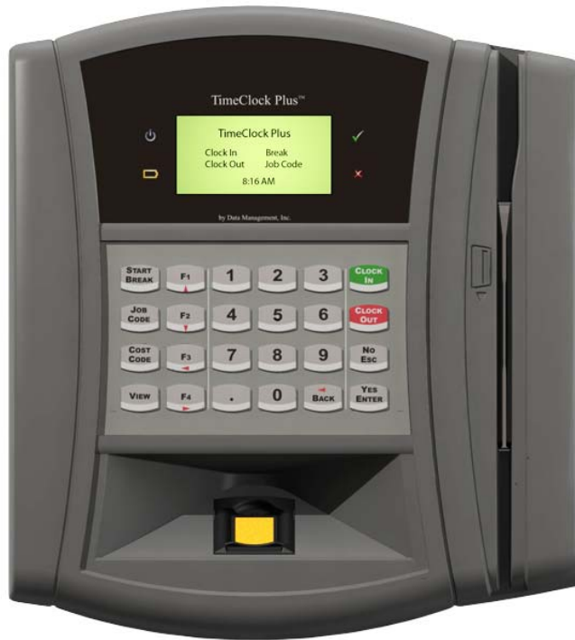
Biometrically controlled employee access for the breakroom or warehouse.