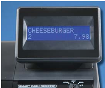
SAM4s ER-945 and ER-920 shown with optional card reader.

An extremely cost-effective and environmentally friendly bundle – each ER-900 series register includes a high quality cash drawer, high-speed thermal printer(s), and a rear customer display.